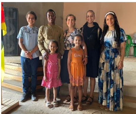
Lichinga, Mozambique May, 2026

Blessed be the God and Father of our Lord Jesus Christ, who according to His abundant mercy has begotten us again to a living hope through the resurrection of Jesus Christ from the dead, 1 Peter 1:3 (NKJV)