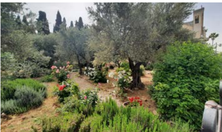
Garden Gethsemane

Our trip, originally planned for the fall of 2020, had been postponed multiple times. We had to navigate personal schedules, COVID-19 protocols, and long plane flights. In the end, it was all worth it for the chance to see the land and to fellowship with a great group of travelers.