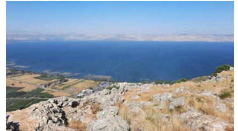
Galilee

Many of you have asked when I will be planning the next trip. No