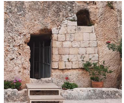
Garden Tomb

In closing, I wanted to leave you with a couple more pictures. Thank you for your prayers. We had a wonderful trip. ✝